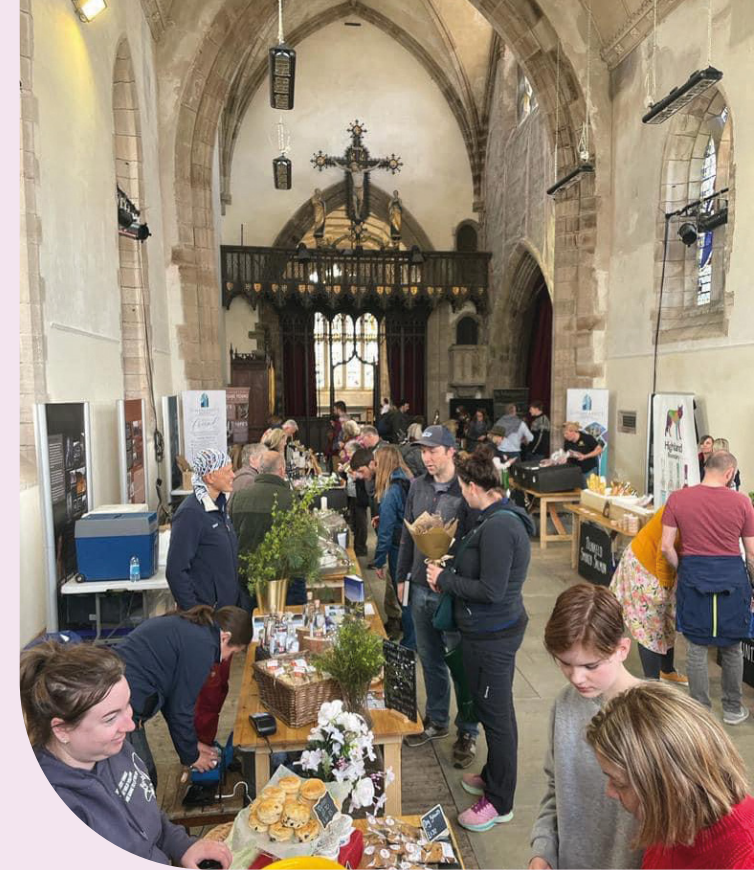
▲ St Margaret's Church, Braemar: Ghillie's Larder farmers and makers market

You should also investigate if there are any conditions attached to the title deeds of the church, or if the seller intends to add them, as these can place limits on what you can do in the building.