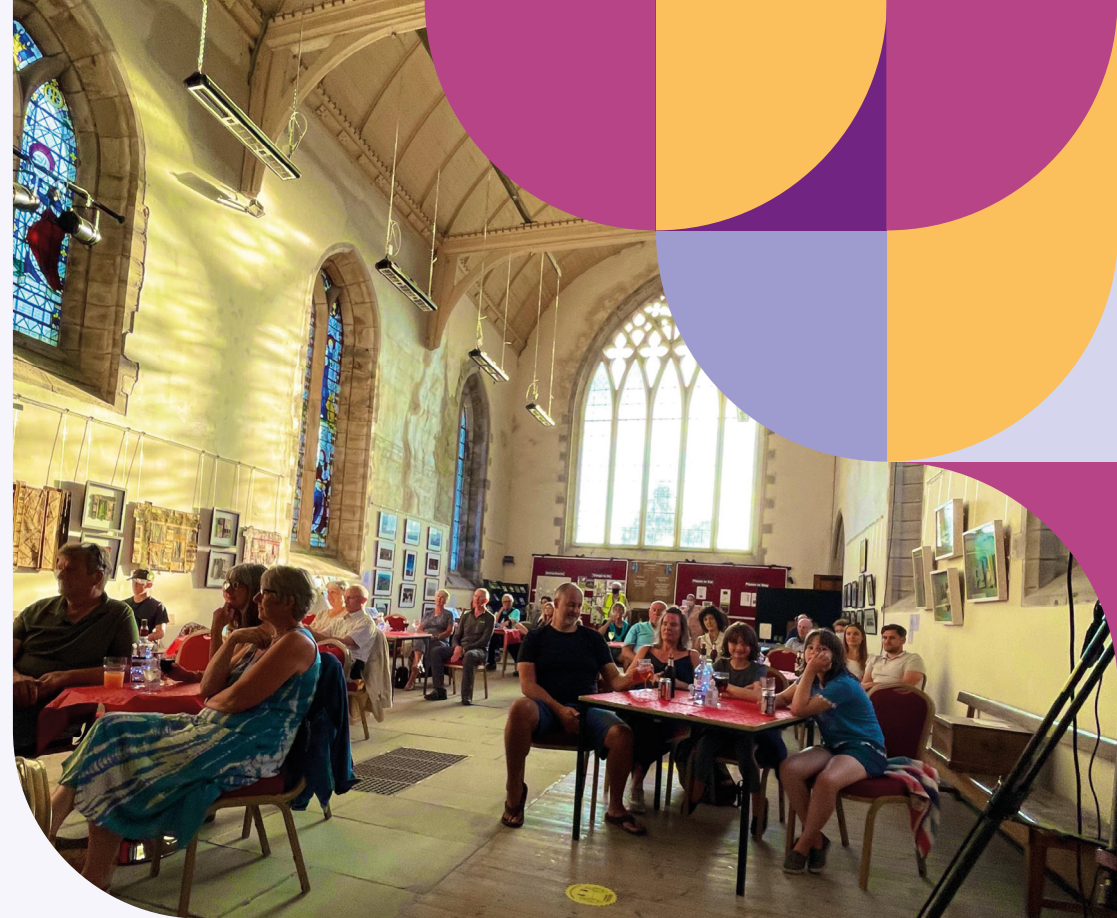
▲ St Margaret's Church, Braemar: Community event

You never know who might be in your local area looking for a new opportunity to become involved, so make sure you spread the word far and wide. If you cannot get a committed group of individuals together with time to devote, then the project is likely to be a non-starter.