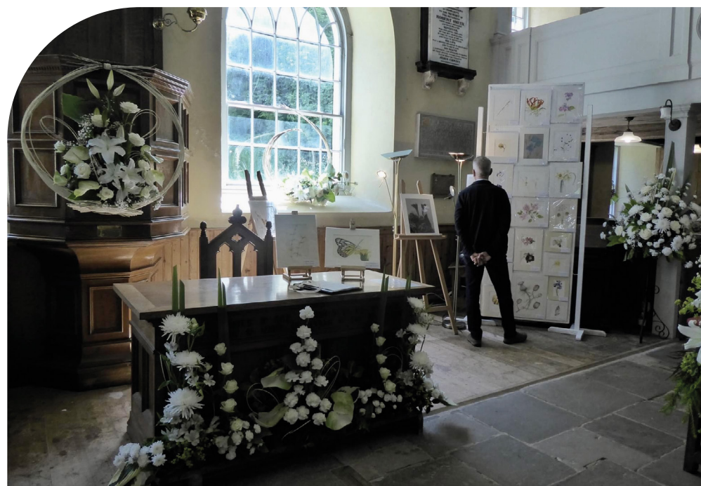
▼ Cromarty East Church: Art and Flowers festival

Taking over a building of any type is a big step for a community and brings with it substantial responsibility. It can appear a daunting prospect, but this document has been designed to guide you through the process.